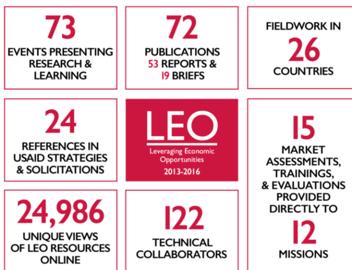
Figure 1: LEO By the Numbers: Key Metrics

The economies and communities in which development work takes place are constantly changing, and there are many forces afoot — urbanization, climate change, migration, structural transformation, changes in global food demands, and the spread of technologies, among many others — that will change the way donors and practitioners alike work, who they partner with, and how they define success. Systems thinking provides an ideal foundation for working in these dynamic, interlinked environments, and the market development field has seen great advancements in the adoption of systems-based approaches. LEO has played an influential role in this evolution, and this bodes well for an increase in effective, efficient programming that facilitates sustainable progress. Yet, despite these great advancements, LEO believes there remains work to be done for market systems approaches to fully achieve their promise and evolve to meet the scale and complexity of the development challenges of the future. Suggestions for a future learning agenda are articulated in Section IV.