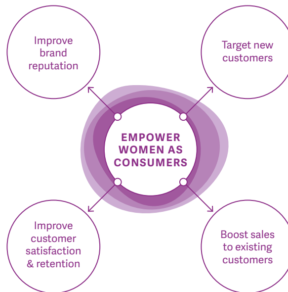
Figure 2: The Business Case for Empowering Women as Consumers

By tailoring their products and services to the needs of female consumers, firms can achieve significant market growth, improve customer satisfaction and retention and grow their brand's reputation. In terms of collaborating with consumer-facing firms (i.e. retail or service companies) and demonstrating to them the business opportunity relating to women as customers, the following activities can serve as good entry points: