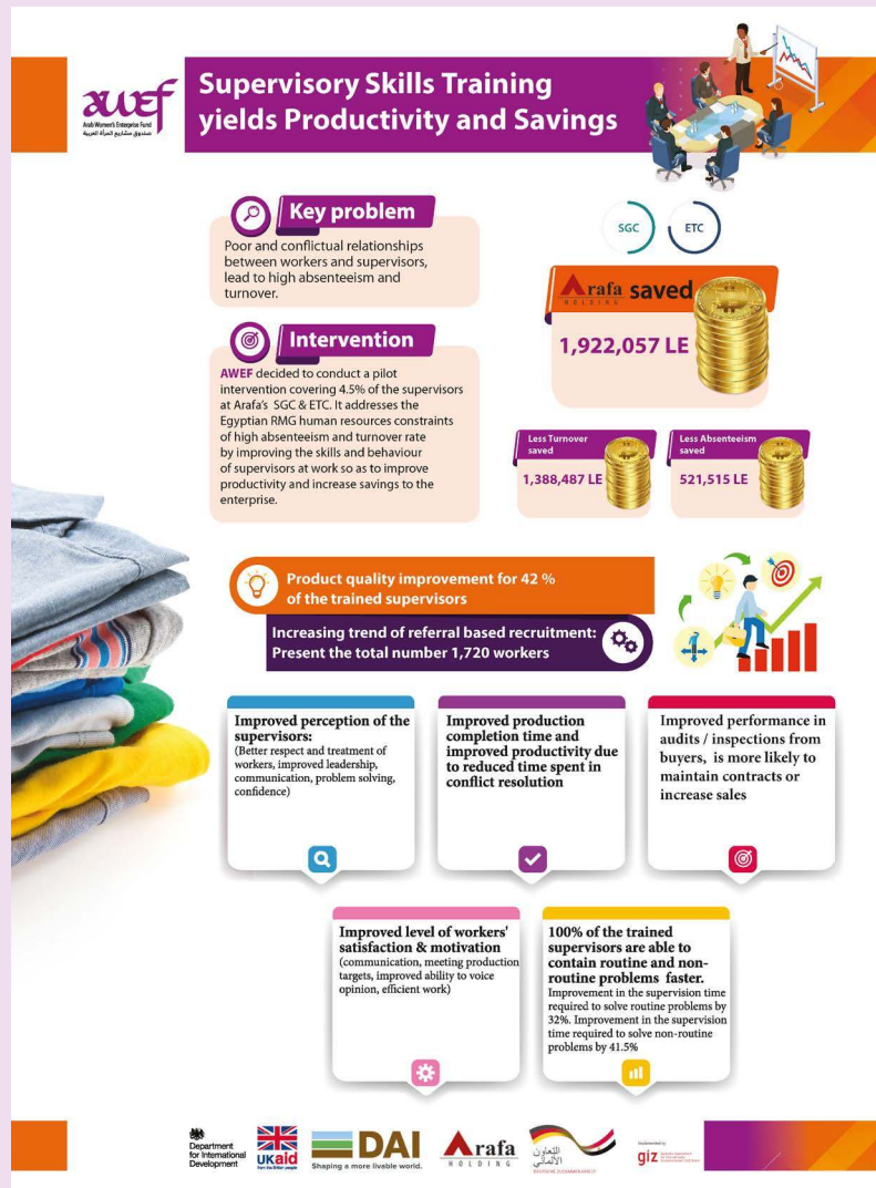
Figure 4: Results of AWEF's RMG Intervention