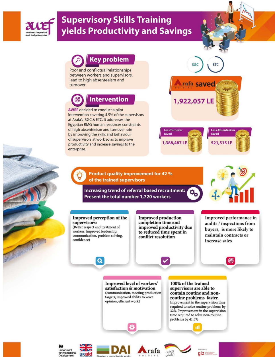
Figure 4: Results of AWEF's RMG Intervention