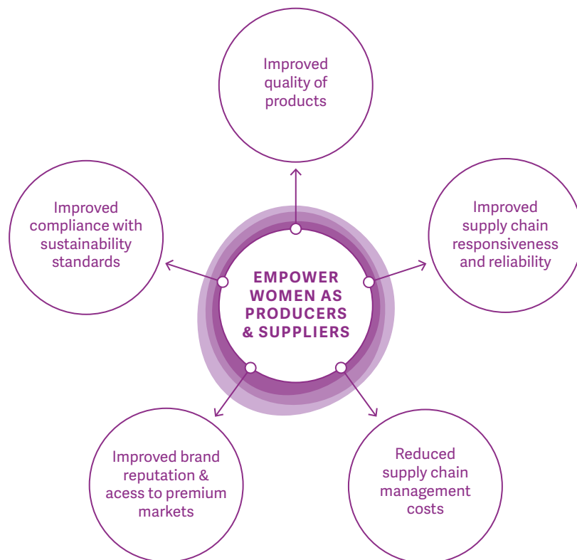
Figure 5: Business Case For Empowering Women Producers and Suppliers

Improving opportunities for women as producers and suppliers can help firms improve their reputation and compliance on social responsibility aims and deliver commercial benefits by improving productivity, quality, and reliability of their supply chains. The following activities offer good entry points for building this business case: