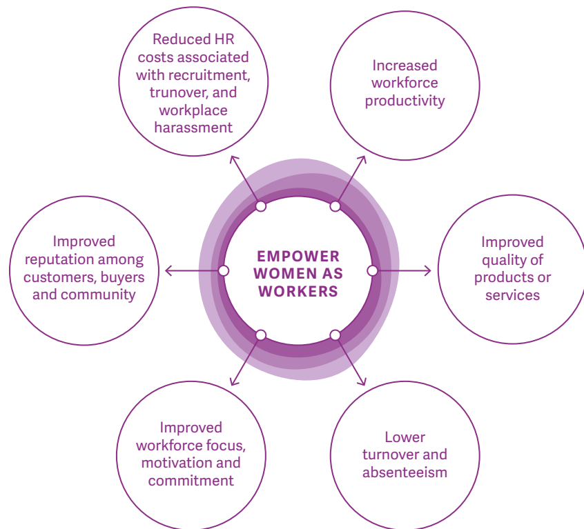
Figure 3: The Business Case for Empowering Women as Workers

Expanding and strengthening women's workforce participation and leadership can benefit companies in terms of access to an increased and more diverse labour pool and skills, which can result in reduced operating costs and increased business returns. The following activities offer good entry points for improving women's workforce participation and empowerment in the workplace: